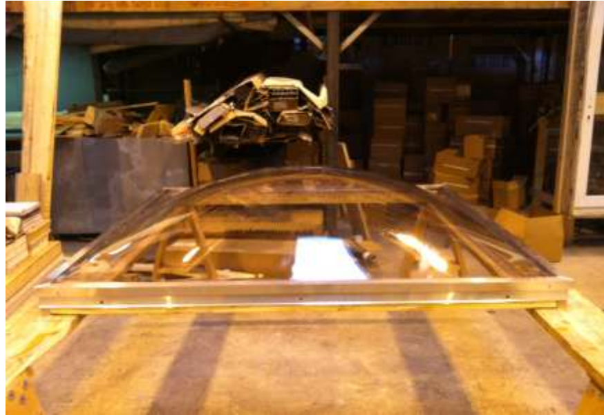
Photo No. 1 CMP Skylight